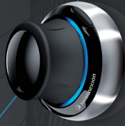
SpaceNavigator™ Advanced 3D Navigation for Everyone

SpaceNavigator for Notebooks is two-thirds the size and half the weight of its desktop counterpart. Its convenient protective travel case makes it ideal for mobile 3D users.