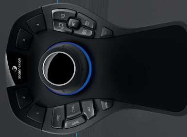
SpaceMouse™ Pro Superior 3D Navigation for Professionals

SpaceMouse Pro delivers advanced comfort and easy access to professional features for a simple, productive workflow.