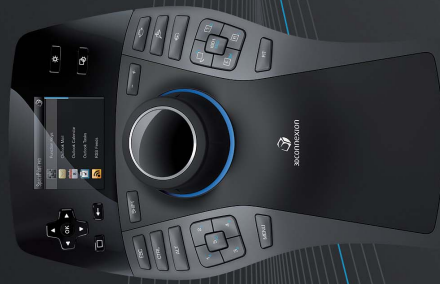
SpacePilot™ Pro Ultimate 3D Navigation for Power Users

SpacePilot Pro is the ultimate professional 3D mouse, engineered to excel in today's most demanding 3D software environments.