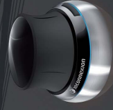
SpaceNavigator™ for Notebooks Enjoy 3D Navigation on the Go

With SpaceNavigator™ or SpaceNavigator™ for Notebooks, everyone can enjoy the freedom of professional 3D navigation, at home, at work or on the road.